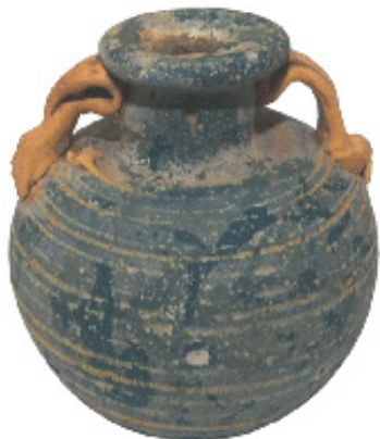
Figure 9 (below). Core-formed aryballos (bottle for scent or oil), eastern Mediterranean, late 6th–5th century B.C., H: 1 15/16", acc. 2011.039; gift of Eric Streiner.

(Wave Crest cont. from p. 3) is a dusty blue decorated handkerchief box featuring the molded "Helmschmied Swirl" shape designed for Monroe by Carl V. Helmschmied, a former decorator at the Mt. Washington works of New Bedford (Figure 6). The box is marked "Wave Crest," the most common Monroe line.