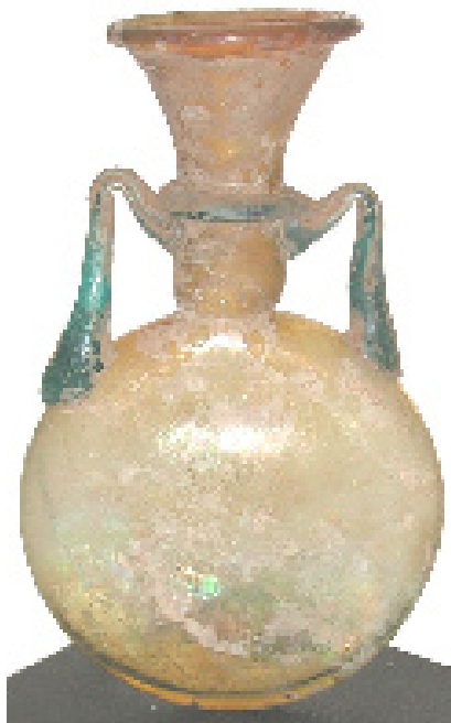
Figure 8 (above). Blown flask, Roman, mid-late 4th century A.D., H: 5 1/2", acc. 2011.038; gift of Eric Streiner.

(Ancient cont. from p. 1) with the beginning of the Roman Empire. This technological advance made the production of glass vessels faster and less expensive. Roman blown glass generally has thinner walls than core-formed glass and tends to show more signs of decomposition. Both Roman vessels from the Streiner gift have acquired the characteristic rough surface and beautiful iridescence caused by slow decay. Louis C. Tiffany and Frederick Carder of Steuben both were inspired by this natural effect and sought to reproduce it in their art glass.