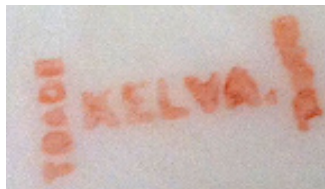
Figure 4 (top left): Cigar holder, printed "KELVA / TRADE / MARK" on underside; Meriden, CT, ca. 1900; H: 2 5/8"; acc. 2011.022; gift of Wilfred & Dolly Cohen.

The most recognizable examples of C.F. Monroe ware are the covered dresser and jewel boxes. One from the Cohen gift (continued on p. 4)