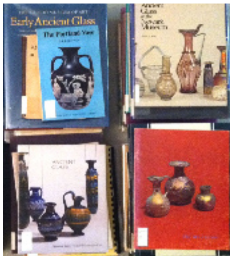
Figure 1 (below). Received at the same time as the Streiner ancient glass donation is a collection of 86 reference books about ancient glass gifted to NBMOG by Museum director Kirk J. Nelson. The books include many hard-to-find titles and serve to establish the NBMOG library as the leading resource of its kind in New England.

The core-forming process, first developed in the mid-16th century B.C. (a long time ago!), is one of the oldest methods for creating a glass vessel. These vessels were made by gathering a layer of glass